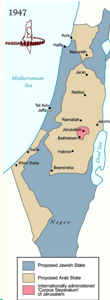
1947: United Nations Partition Plan