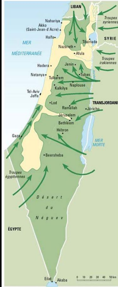
June 1948: Arab armies invade